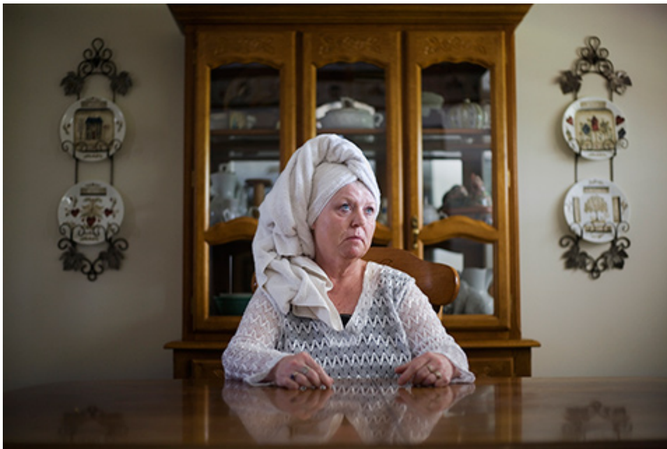
Mom Has the Final Say