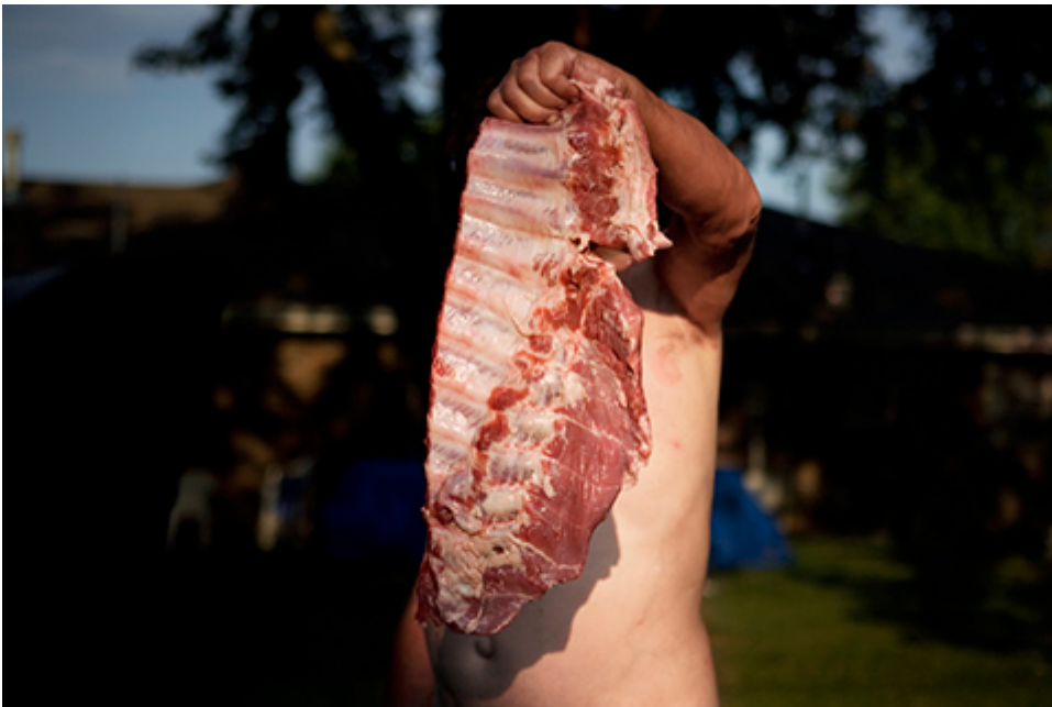
Dad Preparing His Meat