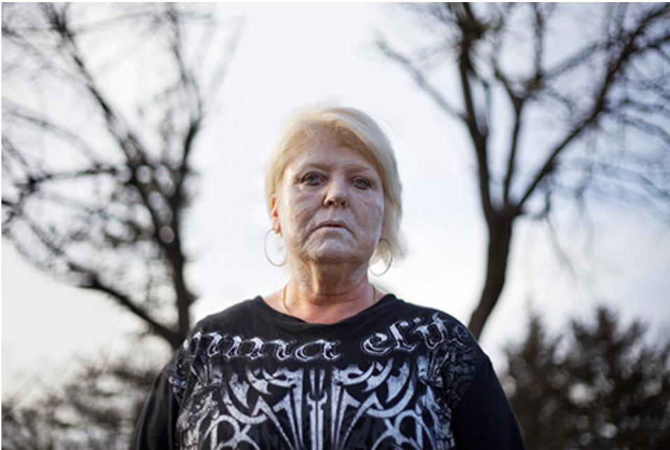
Mom as Martyr