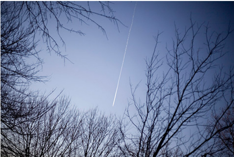
Somewhere Far Away