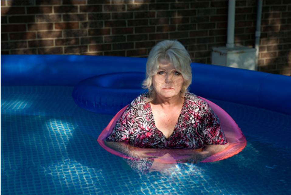
Mom Cooling Off in the Pool